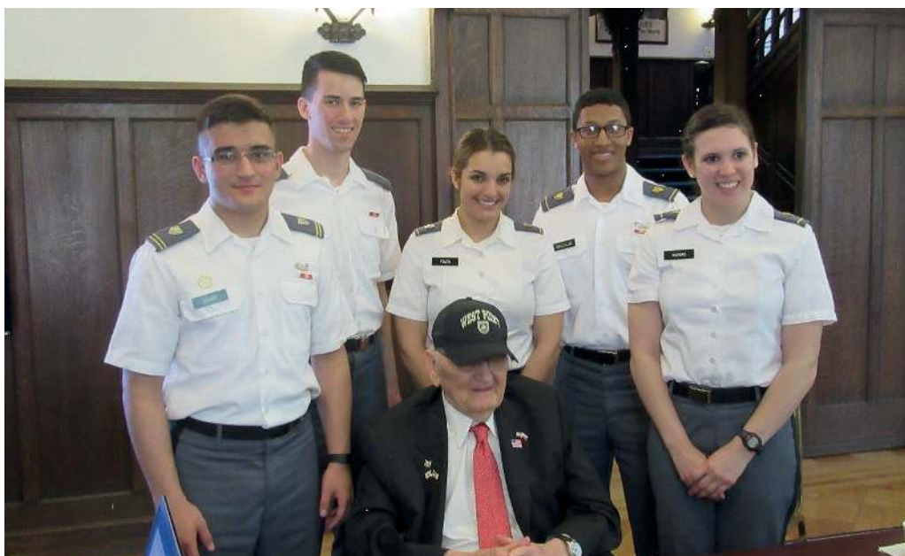
West Point cadets with General Rowny

Mrs. Wellisz analyzed a number of disinformation techniques used by the mainstream media in Poland and abroad when creating a distorted narrative about political developments in Poland under the new, conservative government.