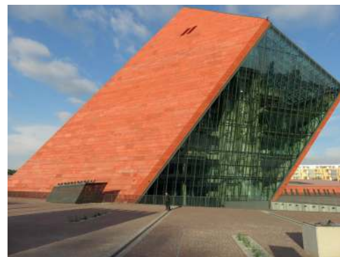
Museum of the Second World War in Poland in Gdansk