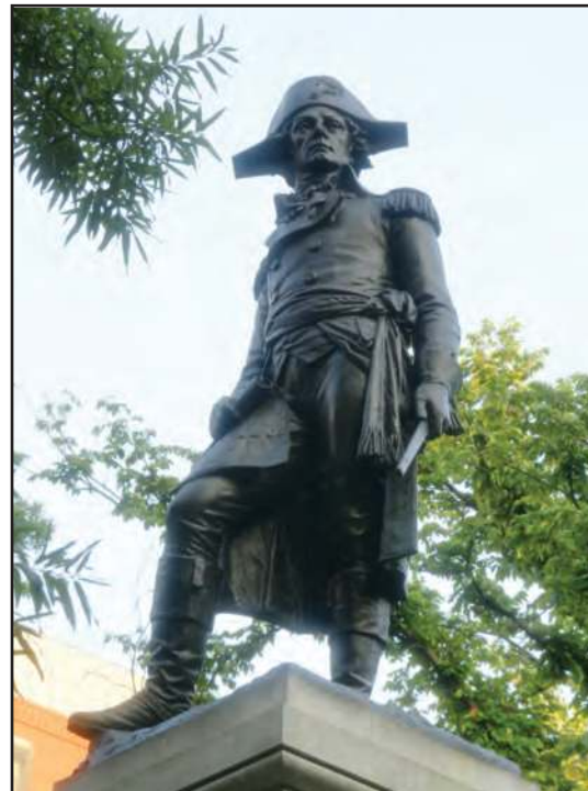
Statue of General Kosciuszko in Lafayette Park in front of the White House.