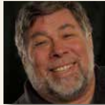
Steve "Woz" Wozniak (1950) Electronics engineer and technology guru who invented and built the world's first useable computer and co-founded Apple with Steve Jobs.