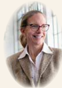
Elizabeth Plater-Zyberk (1950) An originator of New Urbanism, an architectural movement that merges a new self-sustaining community with the existing style.