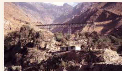
Ernest Malinowski (1818-1899) Engineer and builder of the highest elevated railway in Peru (and the world at the time). Completed in 1908. He is a hero in Peru.