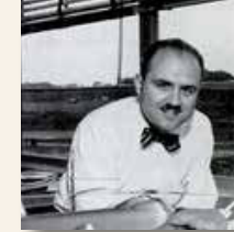
Frank Piasecki (1919-2008) Aviation pioneer, known for his advancements in tandem rotor helicopters. Designed and built his first helicopter at the age of 24. Received the National Medal of Technology from Pres. Reagan.