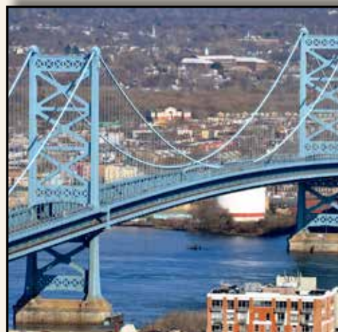
Benjamin Franklin Bridge, Philadelphia