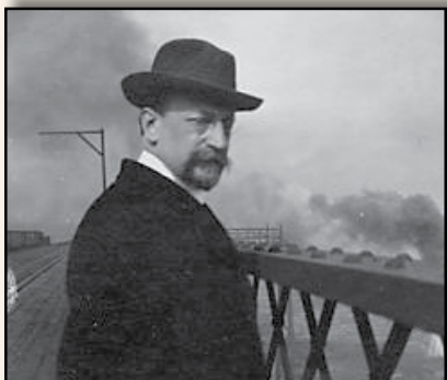
Ralph Modjeski, 1914

Ralph Modjeski (born Rudolf Modrzejewski) is the undeniable grand master of bridges in North America. His elegant designs and marvelous, airy constructions are a feat of architectural vision and engineering skill.