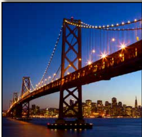
Oakland Bridge, San Francisco