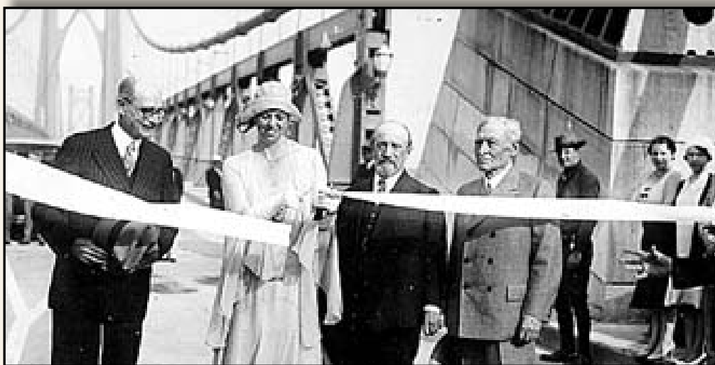
Opening of the (Roosevelt) Mid-Hudson Bridge, 1930

Modjeski, son of the famous actress Helena Modrzejewska, was born on January 27, 1861 in Bochnia, near Krakow, Poland during a time when Poland was divided among the partitioning powers of Austria, Prussia, and Russia. He and his mother emigrated to America in the 1870's (where she altered their name to Modjeski)