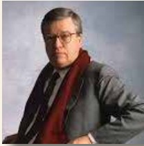
Henry Cobb (1926) Architect whose photographs taken in post-WWII Poland during a study of reconstruction are featured in the book, "1947, The Colors of Ruin, the Reconstruction of Warsaw, Poland."