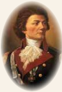
Tadeusz Kosciuszko (1746-1817) Revered military engineer in both Poland and the US and his impressive design, Fortress West Point in NY State, still stands as West Point Military Academy.

There are many notable architects and engineers of Polish heritage whose inventions, innovations and imaginations have made a lasting mark in history, and a few are noted below.