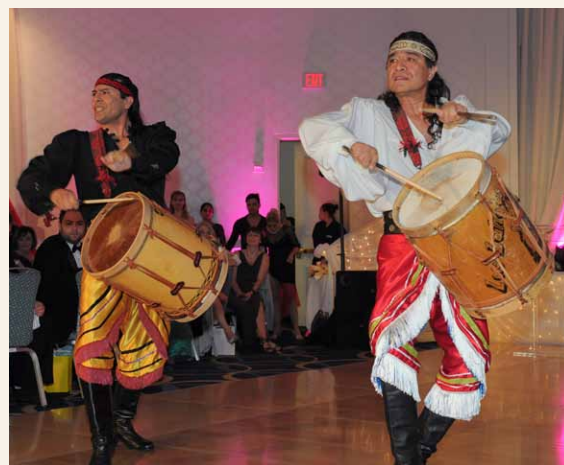
Argentinian Malambos performers